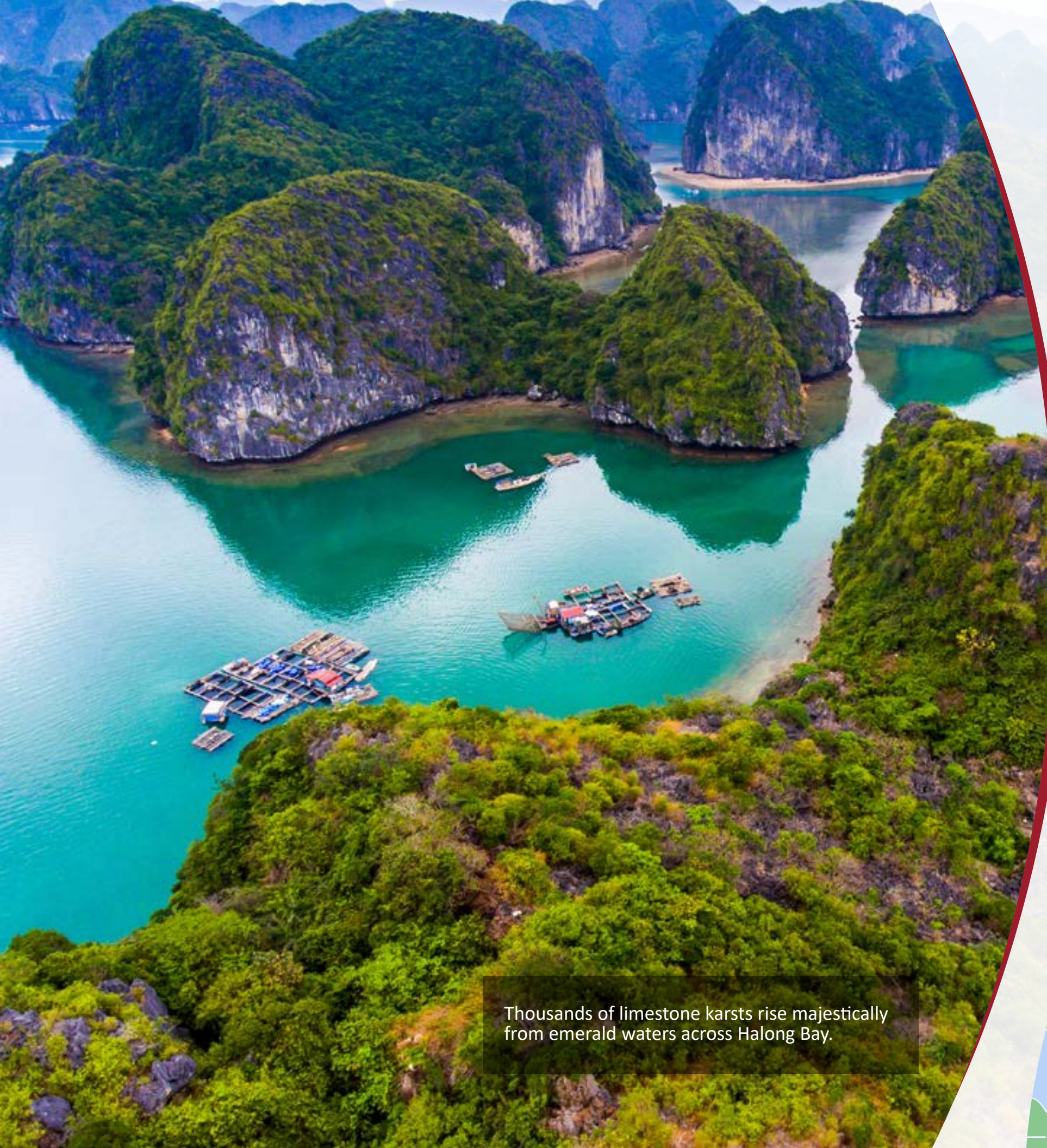
Thousands of limestone karsts rise majestically from emerald waters across Halong Bay.