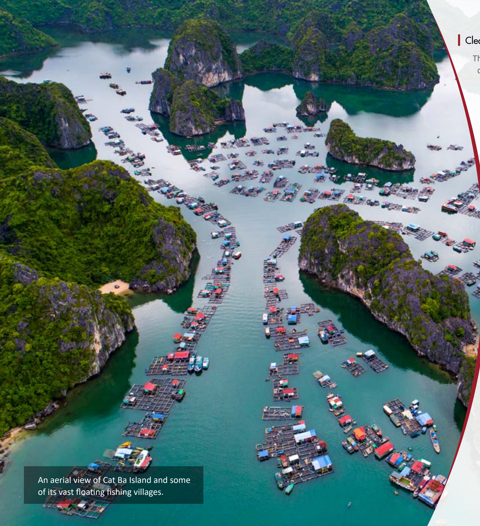
An aerial view of Cat Ba Island and some of its vast floating fishing villages.